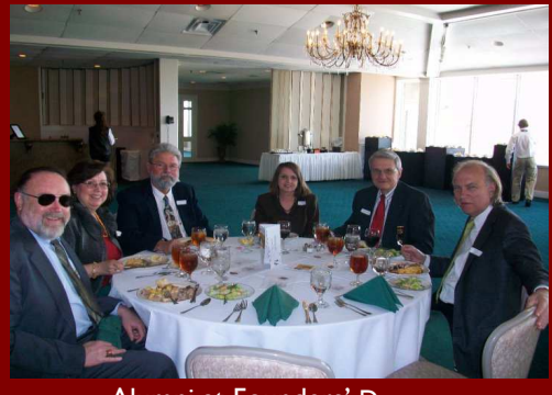
Alumni at Founders' Day