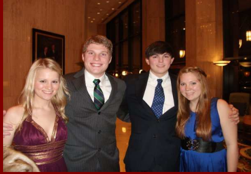
Brothers and their dates ready for Formal