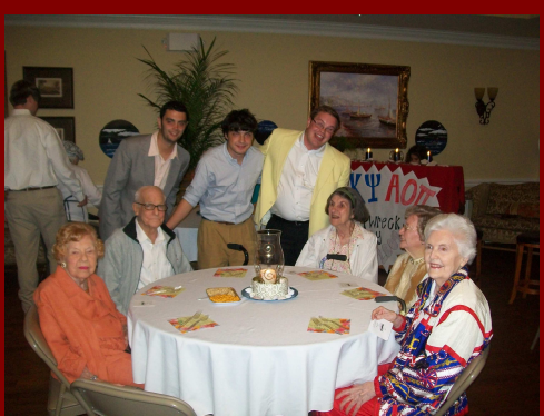
Group at Pine Valley Retirement Home